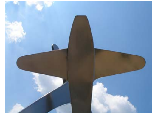
'Whittle In Flight': Whitbread Breweries, Gloucestershire. 2m high sculpture. Commissioned Feb 06. Installed: June 06. Part of £10,000.