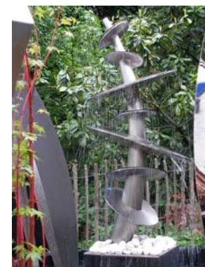
'Ashlands Tower': Bovis Homes, Wellingborough. 10m high sequenced water sculpture. Under Consideration. £500,000. Model 1.75m high.