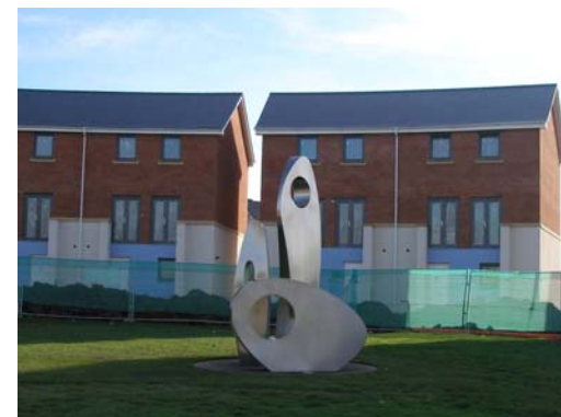
'Elemental': Persimmon Homes Ltd, Portishead, Ashlands Gateway. 4m then 3, 2 & 1.2m high sculptures. Installed by Jan 07. £30,000.